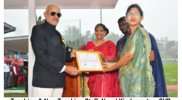
Teaching &amp; Non-Teaching Staff, Naval Kindergarten, SVP