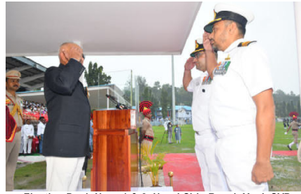
Floating Dock Navy 1 &amp; 2, Naval Ship Repair Yard, SVP