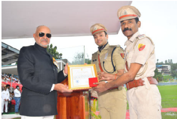
Andaman &amp; Nicobar Fire &amp; Emergency Services Training Centre

Lt. Governor reaffirmed his commitment and that of the Administration to the Islands' modern development, ensuring they play a vital role in realizing the Hon'ble Prime Minister's vision of a 'Viksit Bharat'. Earlier, the Lt. Governor presented President's Police Medals and Lt. Governor's Commendation Certificates to the recipients for their outstanding contribution in various fields.