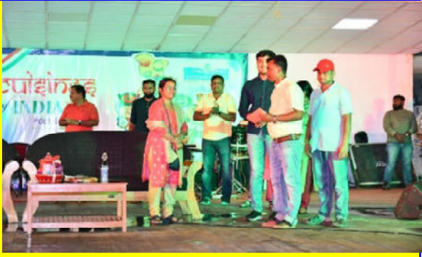
Second prize winner