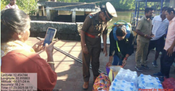
Former offenders now serve on the Mobile Squad, dismantling traps and guiding others away from poaching.

Many are now engaged as daily-wage workers (DRMs) under the Forest Department. For a place as geographically isolated as the Andaman Islands, even small-scale rehabilitation like this has had a visible impact. With more locals involved in protection, not just policing, forest intelligence has improved, enforcement has become faster, and community ownership has grown stronger.