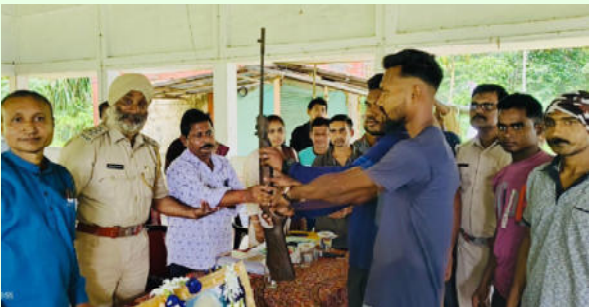
In a rare shift, locals surrendered two illegal firearms-marking a powerful turn in community attitudes.

During recent operations, forest officials managed to save and safely release over 10 wild animals found trapped but still alive. Each rescue has required courage, speed, and often, a kind of patience that comes only from deep commitment.