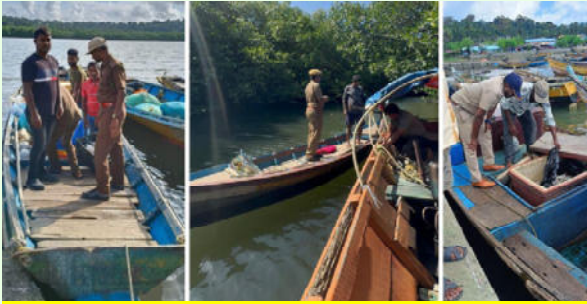
The Rangat Forest Station stands as a 24x7 thana for the wild, backed by community trust and forest vigilance.