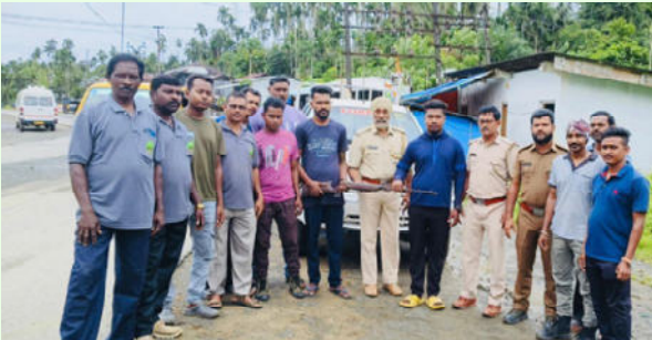
A Second firearm was handed in during anti-poaching efforts in Rangat, signalling growing trust in forest enforcement.