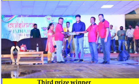
Third prize winner