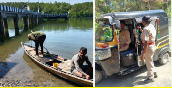
Forest staff intercept fishing boats during random checks to prevent smuggling of meat, timber, and forest produce.

Vehicles passing through are now routinely intercepted and searched. On several occasions, even public transport - buses, taxis, local ferries - has been checked based on specific tip-offs. "We've seized timber, forest produce, and even hunted meat being smuggled out in broad daylight," shares one forest staff member. "In the past, we had no way to act immediately. Now, we don't have to wait."