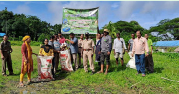
Under a captive breeding programme, 8 Andaman Wild Pigs were rewilded to support the Jarawa tribe's dietary needs.

females - have already been released into the forest for the Jarawa community. This effort has not only strengthened the ecological balance, but also helped meet the tribe's protein needs in a sustainable way.