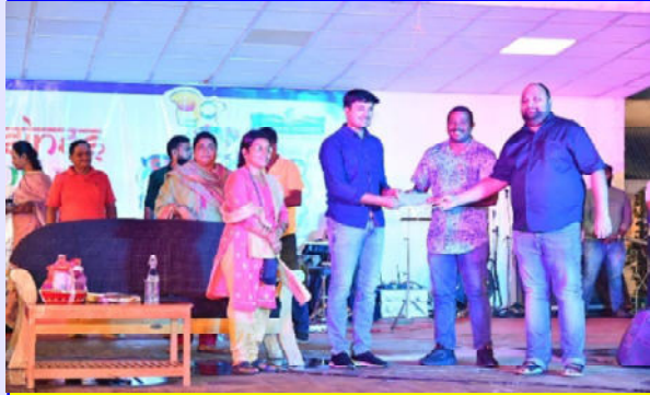
First prize winner

Addressing the gathering, the chief guest appreciated the efforts of the Tourism Department, Food Safety Department along with allied Departments for the excellent arrangements and the smooth conduct of the 3-days festival. He further stated that the festival brings people together in