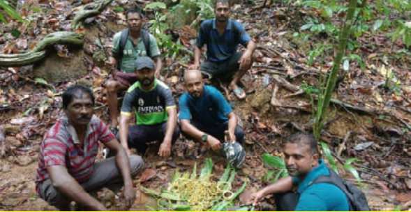
Joint patrolling teams helped remove 800+ nylon traps from forest interiors, where hunting once went unchecked.

Joint patrolling teams have been especially active in sensitive areas like Tekadera and Kaushalya Nagar, where illegal hunting activity was once common.