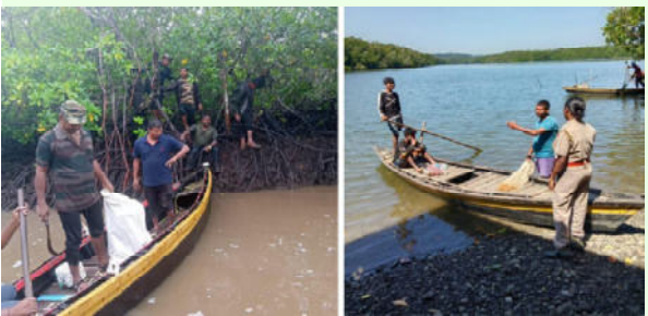
Forest staff and locals patrol Andaman's mangroves by boat, working together to stop poaching and protect wildlife.

In just one year, a 24x7 forest station in Middle Andaman has cracked over 100 wildlife crime cases, seized 800+ hunting traps, rescued deer and wild pigs, and begun rebuilding trust with locals - some of whom were once poachers